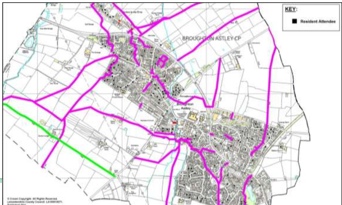
Figure 2: Distribution of Resident Attendees at Public Information Evening:

3.5 The distribution of resident attendees at the event is illustrated in figure 2.